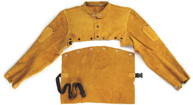
# 73-14 DETACHABLE BIB